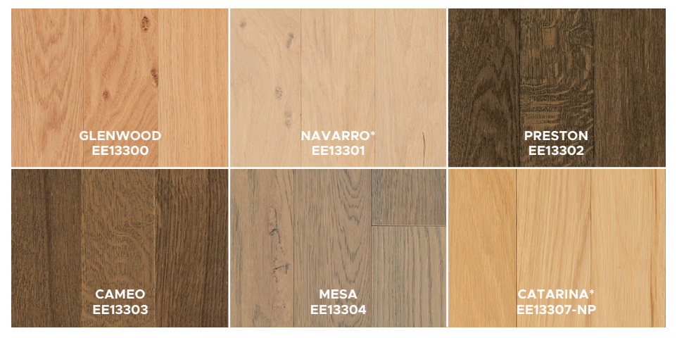
*High Shade Variation