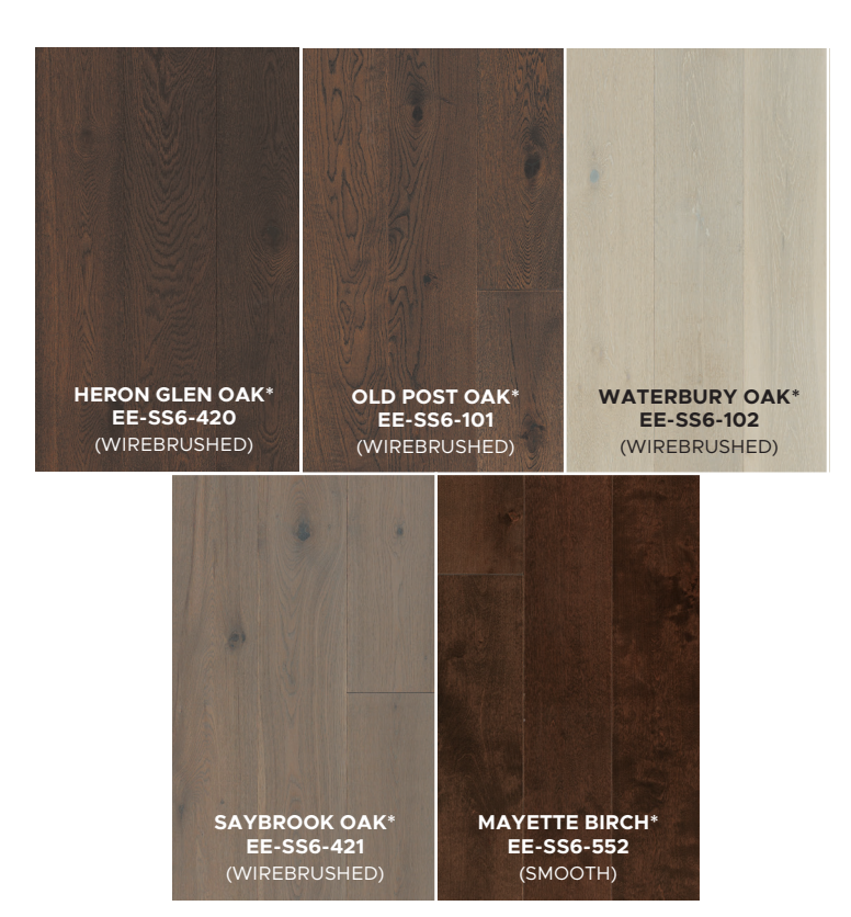
*High Shade Variation

3/4" x 5-7/8" x Random length (24" to 75", Average length 56") 19mm x 150mm x Random length (600mm to 1900mm, Average length 1425mm)