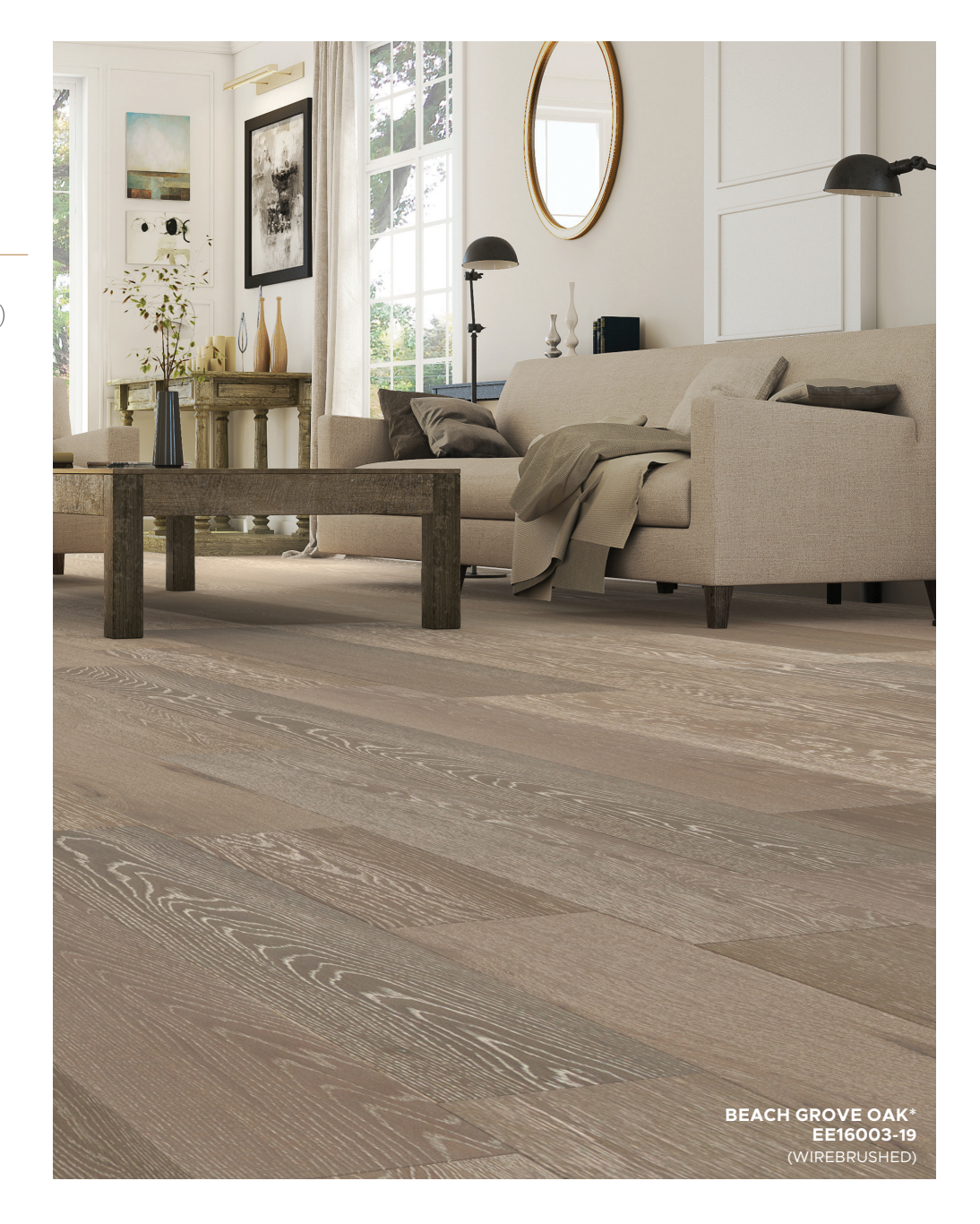
*High Shade Variation