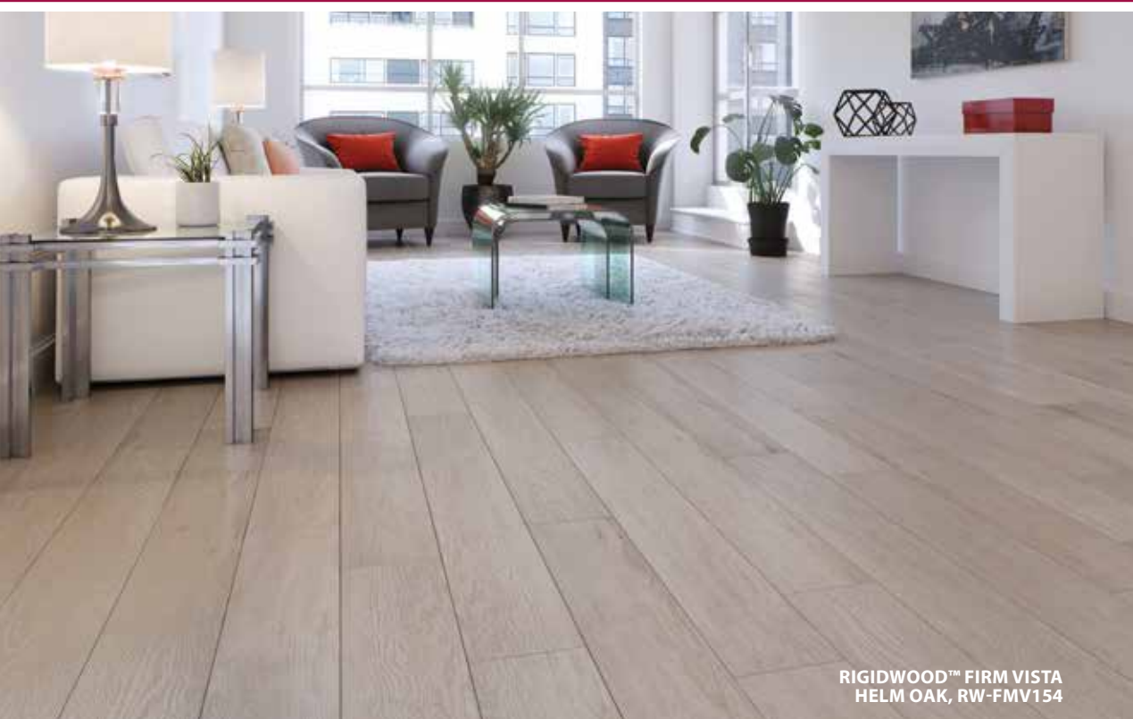
RIGIDWOOD™ FIRM VISTA HELM OAK, RW-FMV154

RigidWood™ has all the performance benefits of a TORLYS smart floor...now in Rigid LVT.