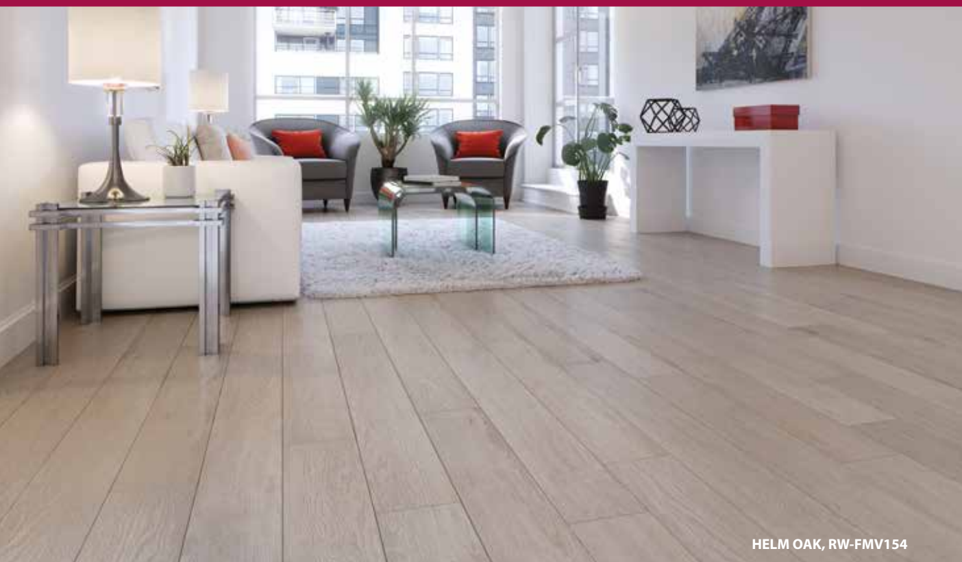
HELM OAK, RW-FMV154