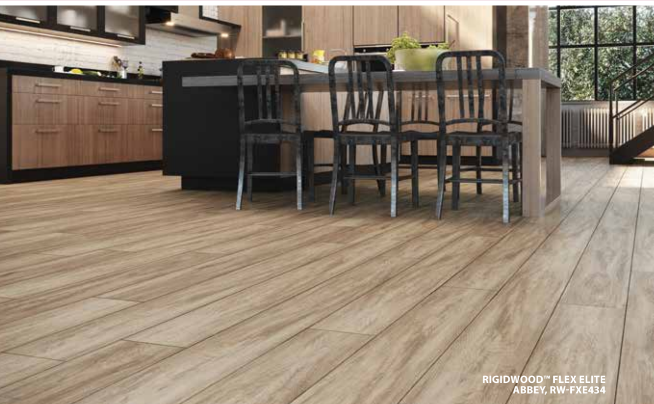
RIGIDWOOD™ FLEX ELITE ABBAY, RW-FXE434

TORLYS makes it easy by offering a complete range of Rigid LVT that has all the benefits of a TORLYS Smart Floor, in both Flex & Firm constructions. Pick the flooring suitable for your lifestyle and you will be sure to find a range of colours, patterns and sizes to suit any décor with no peaking, no cupping and no gapping – guaranteed!