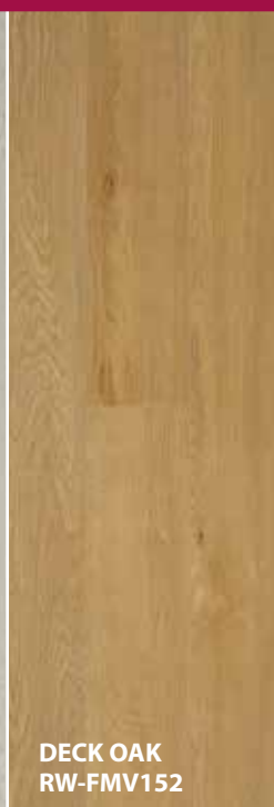
DECK OAK RW-FMV152