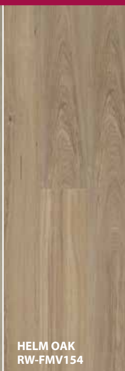
HELM OAK RW-FMV154