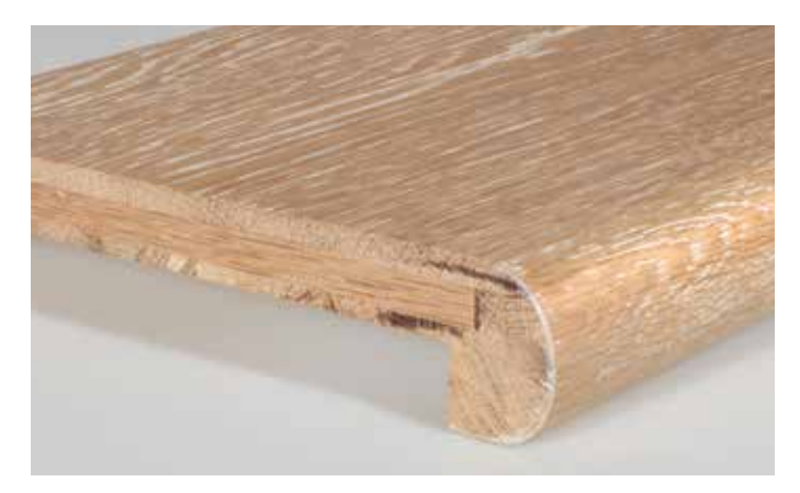
Suitable for floating and nail/glue down applications.*

This is the world's first Stair Nosing that can also be installed FLOATING.