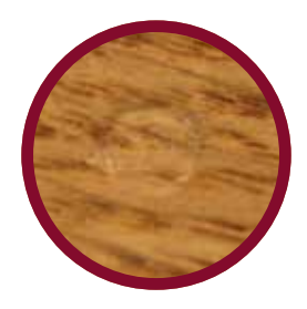
TORYS Smart Hardwood with Smart Core

TORLYS Smart Hardwood Core is 34% harder than solid hardwood and 56% harder than plywood and fillet core hardwood.