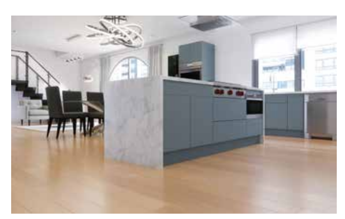
EVEREST DESIGNER COASTAL OAK