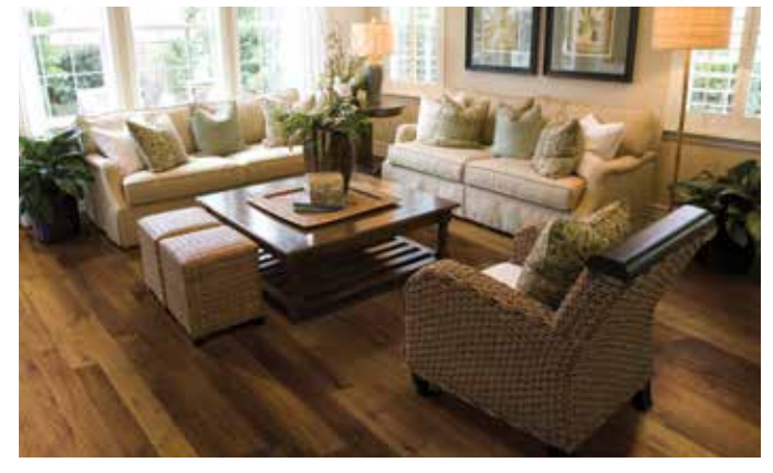
BROOKHAVEN OAK HCU68222

Valid only in Canada. Applies to residential installations only.