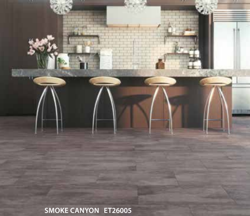
SMOKE CANYON ET26005