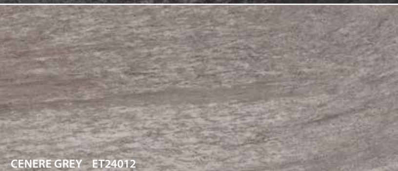
CENERE GREY ET24012