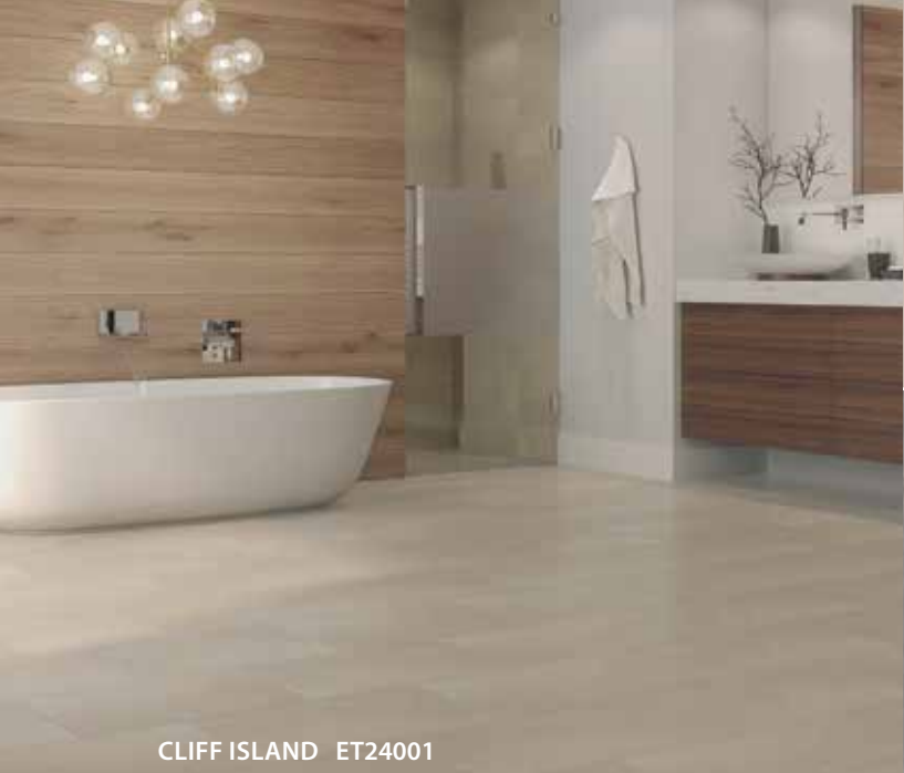
CLIFF ISLAND ET24001