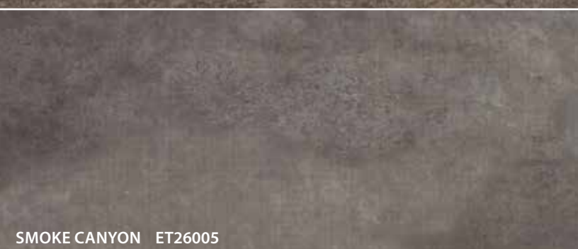
SMOKE CANYON ET26005