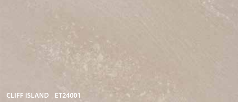
CLIFF ISLAND ET24001