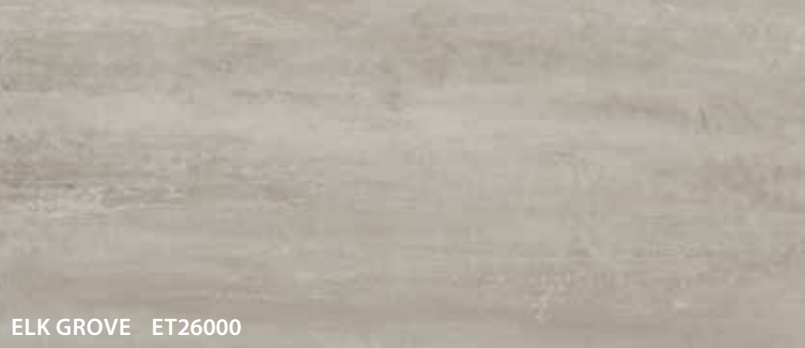
ELK GROVE ET26000