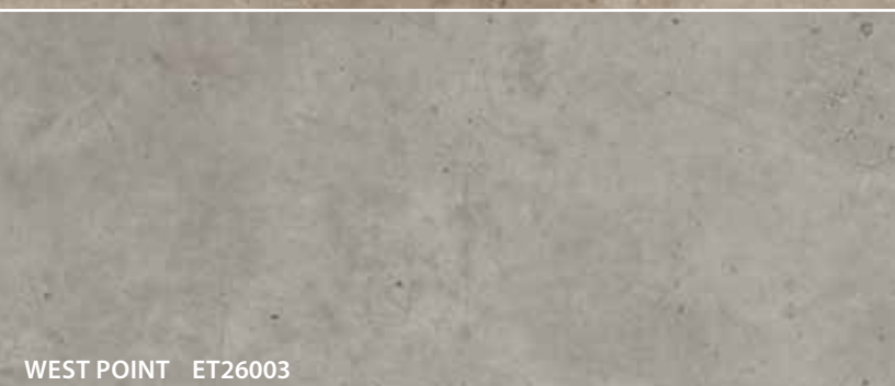
WEST POINT ET26003