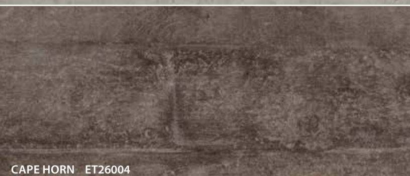
CAPE HORN ET26004